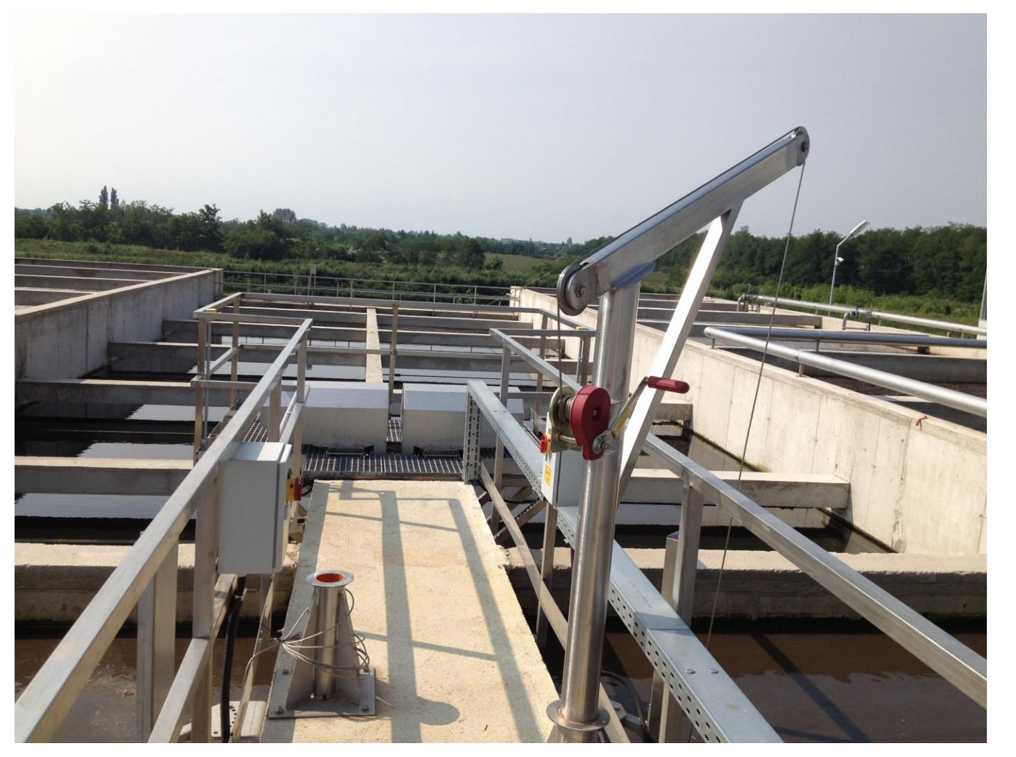
Mechanical pre-treatment, bio-P removal, biological treatment, disinfection, sludge dewatering, sludge composting