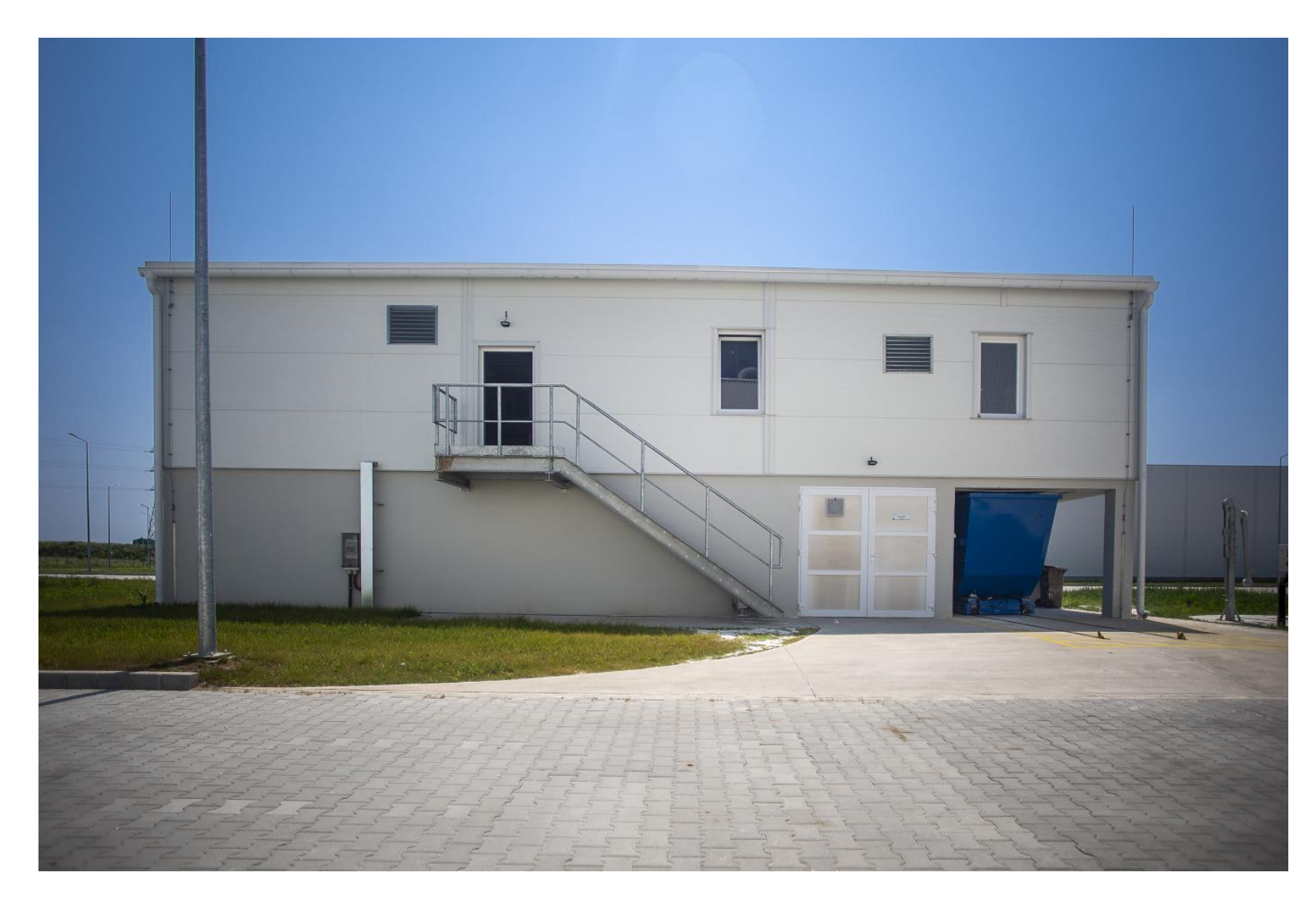
Mechanical pre-treatment, DAF flotation, sludge dewatering