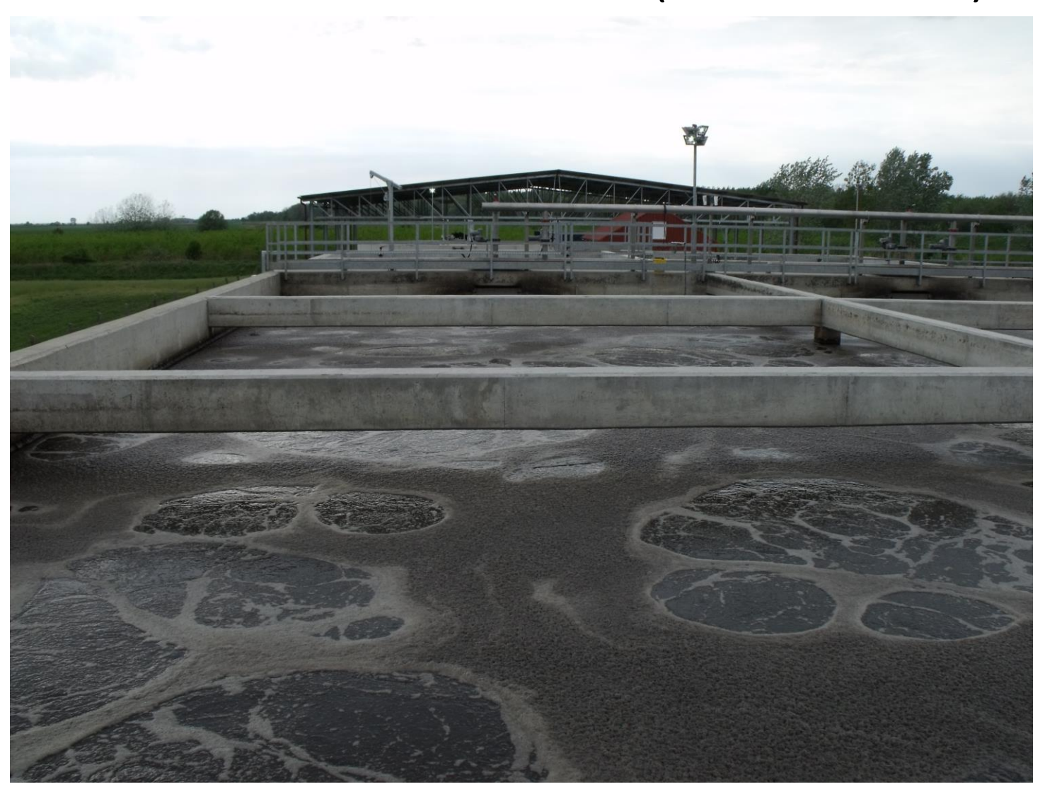
Mechanical pre-treatment unit, biological treatment (BIOCOS technology), sludge thickening, disinfection