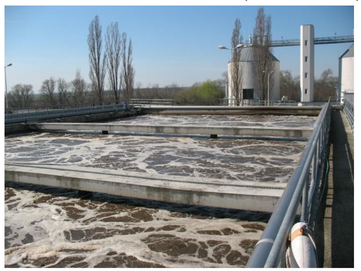
Mechanical pre-treatment, primary clarification, biological treatment, disifection, anaerobic sludge digestion, sludge dewatering