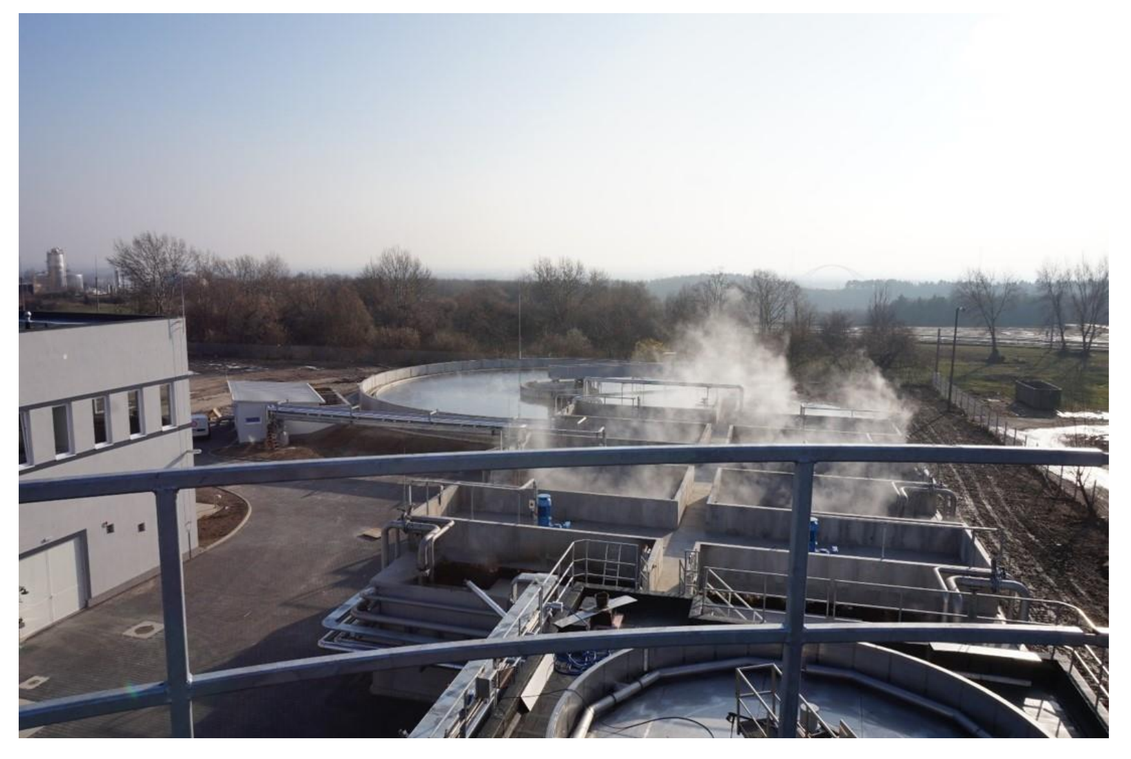
Mechanical pre-treatment, pH adjustment, DAF flotation, cooling, biological treatment, sludge dewatering