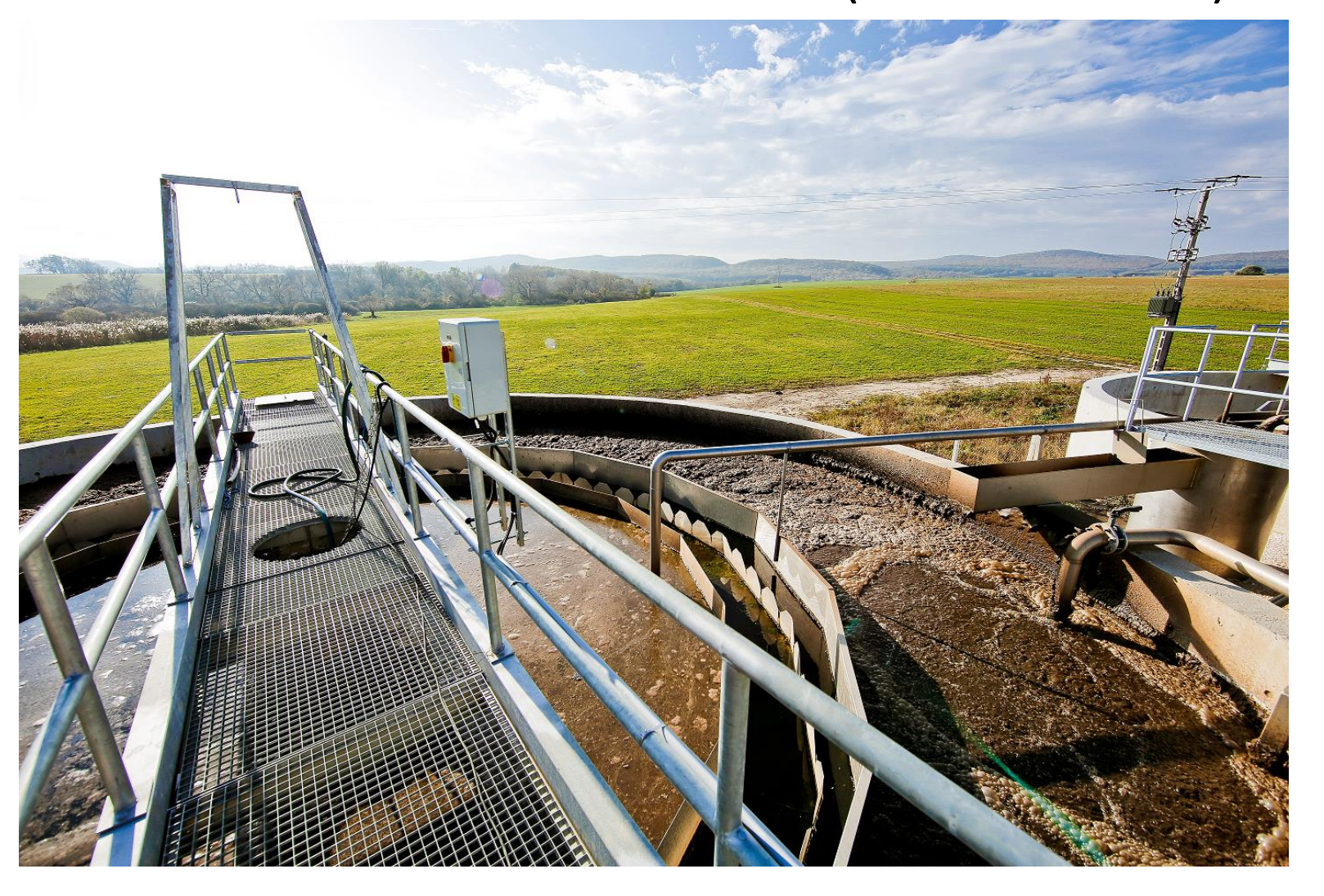
Mechanical pre-treatment, primary clarification, biological treatment, disinfection, sludge thickening