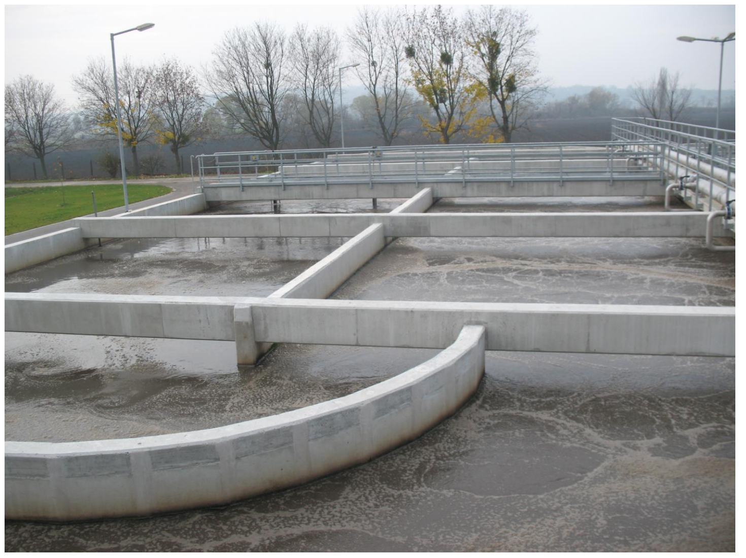
Network end pumping station, mechanical pre-treatment, biological treatment, disinfection, sludge dewatering