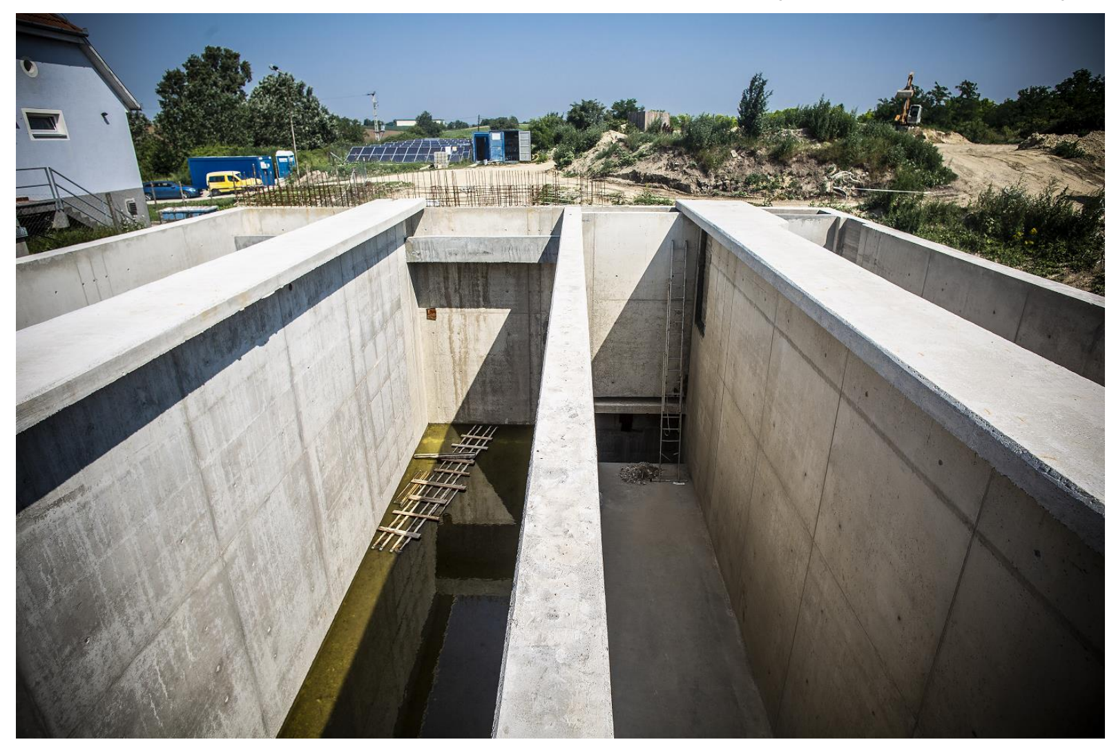
Mechanical pre-treatment unit, biological treatment (BIOCOS technology), sludge dewatering, disinfection