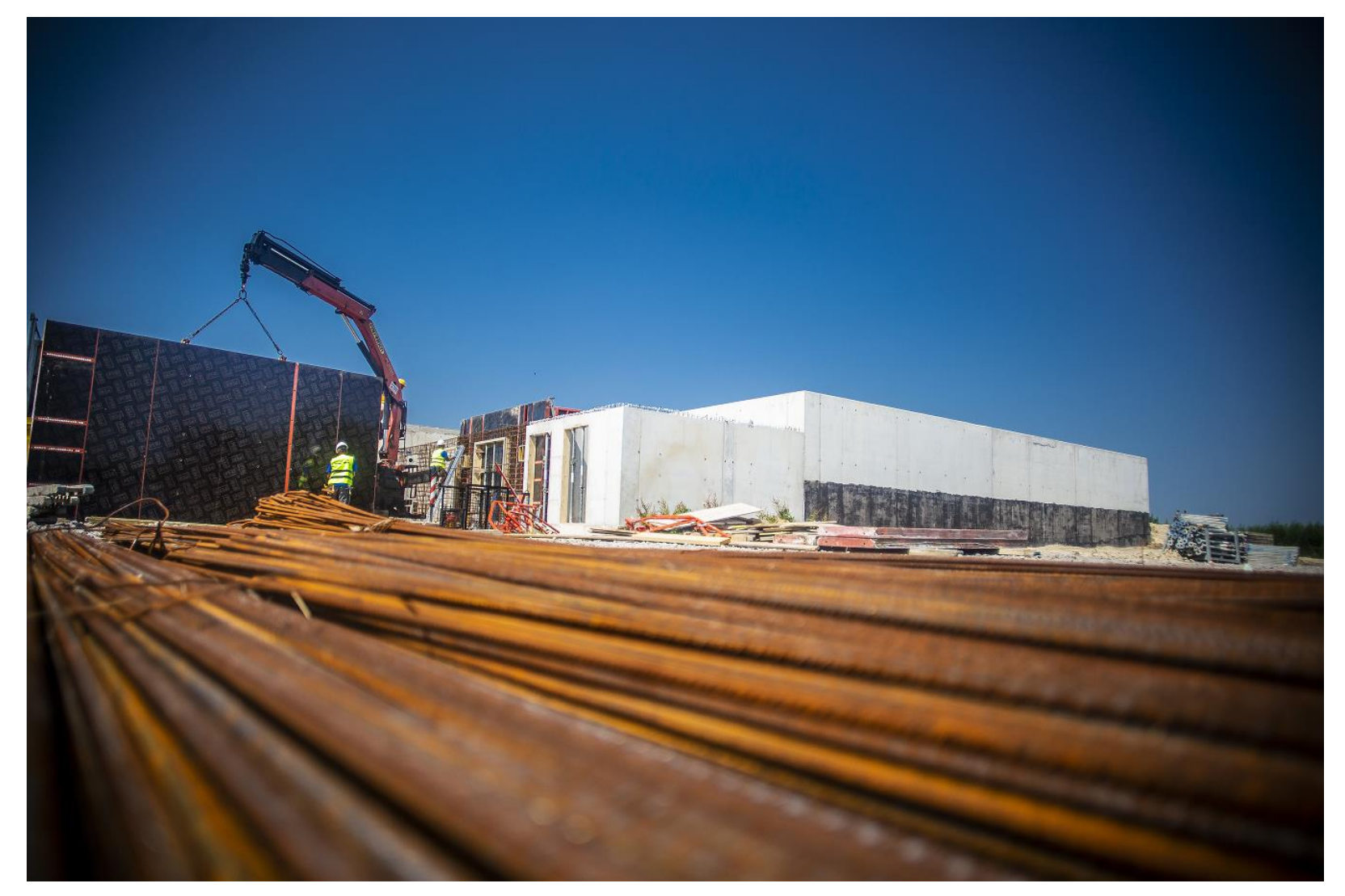
Mechanical pre-treatment unit, biological treatment (BIOCOS technology), sludge thickening, disinfection