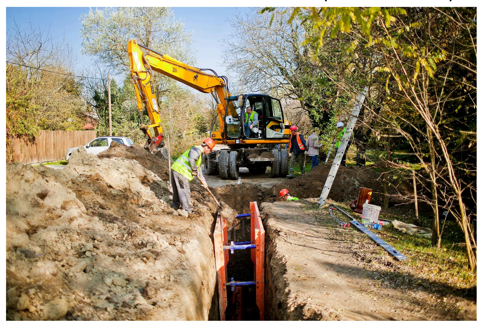
9 municipalities' sewer network and their pumping stations